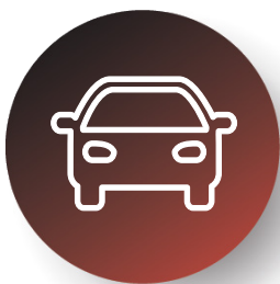
Scope 1 - Vehicles