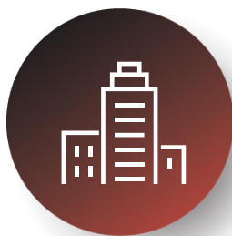
Scope 2 - Facilities