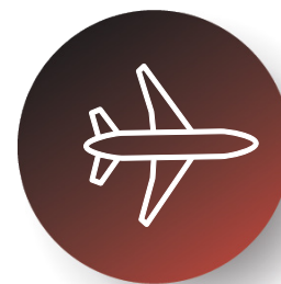
Scope 3 - Air Travel